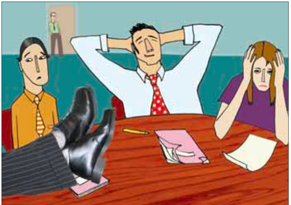
ILLUSTRATION: GILL BUTTON

The impact of non-verbal communication was famously demonstrated during the historic 1960